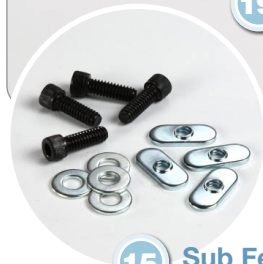
15 Sub Fence Mounting Hardware